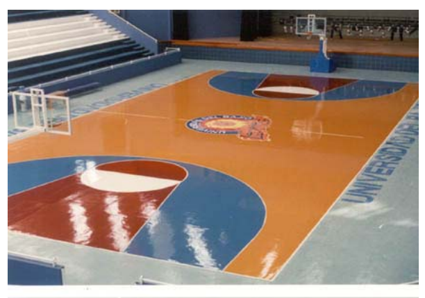
PUR Guard SF, Sport Floor Install on Indoor

Polyurethane Grade for Outdoor & Indoor # Self-Leveling Smooth/Flat, Soft Type # VOC Free, Solvent Free